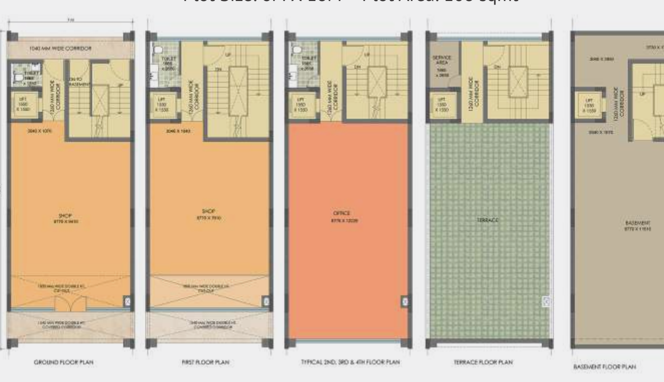
Plot Size: 6M X 18M • Plot Area: 108 sqmt