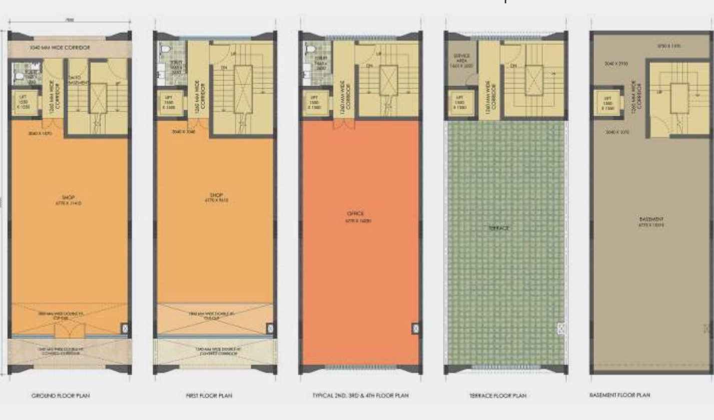
Plot Size: 7M X20M ■ Plot Area: 140 sqmt